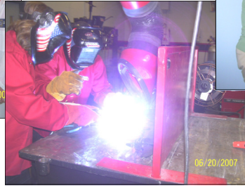
Lincoln Electric-learning welding