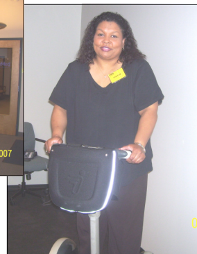
Parker Hannifin-on a Segway