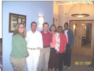
Cleveland Medical Devices