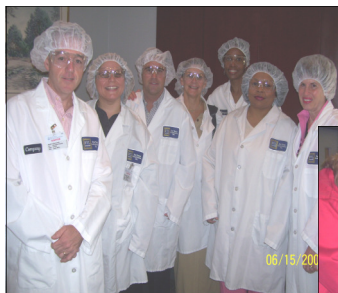
Ben Venue Labs-ready for a tour

Businesses that participated were: Ben Venue Laboratories, Beachwood Business Development Center, Bedford Medical Center, Cleveland Medical Devices, Eaton Corporation, House of Blues, Lincoln Electric Corp., Ohio Commerce Bank, Parker Hannifin, and the Taylor Chair Company.